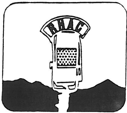
Radio Historical Association of Colorado